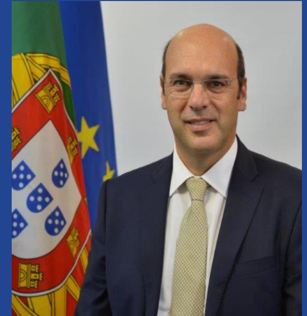
Support from Portugal's Minister of State, Economy and Digital Transition, Pedro Siza Vieira