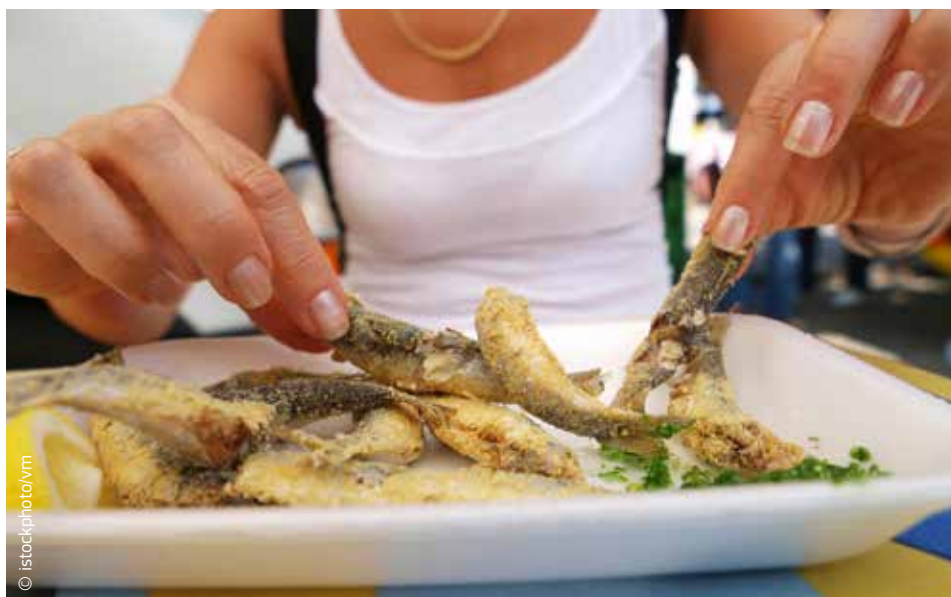
There is an ever-increasing demand for seafood.

The European Maritime and Fisheries Fund is worth €6.5 billion. This fund replaces the existing European Fisheries Fund and also groups a number of other ancillary funds into a single instrument. Red tape has been cut so that beneficiaries have easier access to capital.