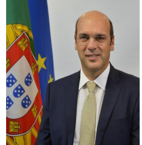
Support from Portugal's Minister of State, Economy and Digital Transition, Pedro Siza Vieira